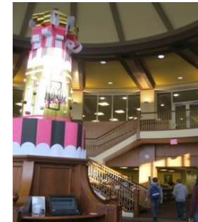
Online catalog and entrance to second floor computer area.