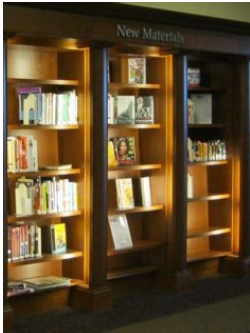
New materials Display near front check out desk.